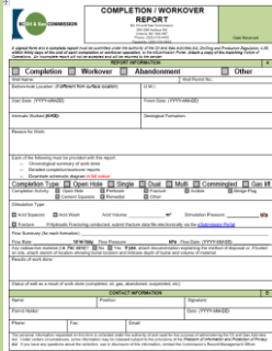
Completion /Workover Cover Page